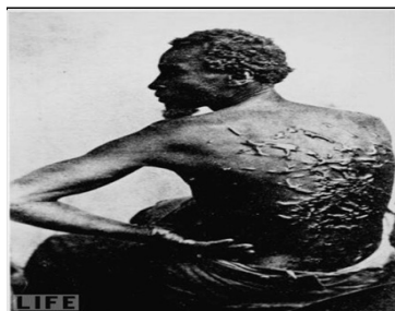
1. This is a picture of a former slave who reveals the scars on his back from whippings before he escaped to become a Union soldier.