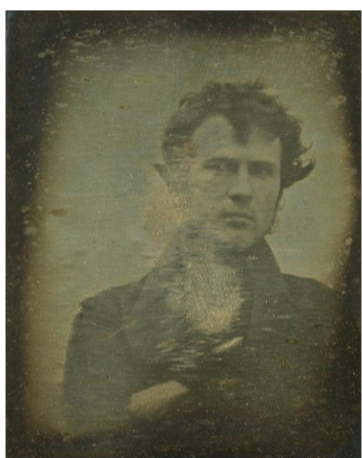
5. The world's first selfie taken by Robert Cornelius in Philadelphia in October, 1839.