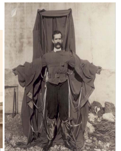
9. Franz Reichelt displaying his "parachute suit." He died testing it by jumping off the Eiffel Tower. 1912