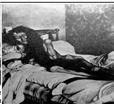
2. Mademoiselle Blanche Monnier - the girl who who was locked in a dungeon for 25 years. Mademoiselle Blanche Monnier, Anonymous letter. The disturbing picture above is not a still shot from a horror movie, but rather is a hospital-room photo of Blanche Monnier, a French girl who was kept captive for 25 years in a padlocked, Her discovery occurred on May 23, 1901 after the Paris Attorney General received an anonymous letter indicating a woman was being held captive in a home located on a "21 Visitation" street in Poitiers, France.