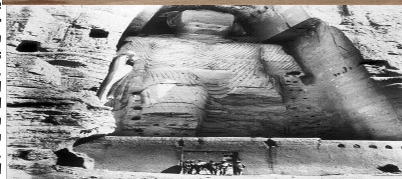
8. 1931: French archaeologist Joseph Hackin exploring the Grand Buddha of Bamiyan, Afghanistan It was dynamited and destroyed in March 2001 by the Taliban. Chinese Buddhist pilgrim Xuanzang visited the site on 30 April 630 AD and described Bamiyan as a flourishing Buddhist center "with more than ten monasteries and more than a thousand monks".