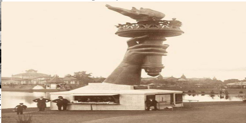
7. Between 1876 and 1882, the arm of the Statue of Liberty was in Madison Square Park, New York, for fund-raising to complete the Statue.